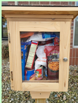
Located at 2600 Easton St. NE

Here at the Plain Township Administrative Offices, we installed a mini food pantry. If you need something, take something. If you can give something, leave something. It is a drive up converted lending library. It is stocked with nonperishables like peanut butter, tuna, canned vegetables, soup, canned meats, canned meals, pasta and cereal.